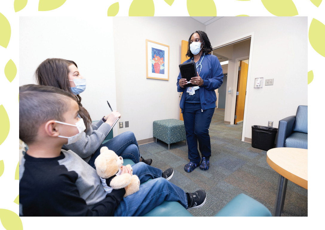
A nurse will meet with you.