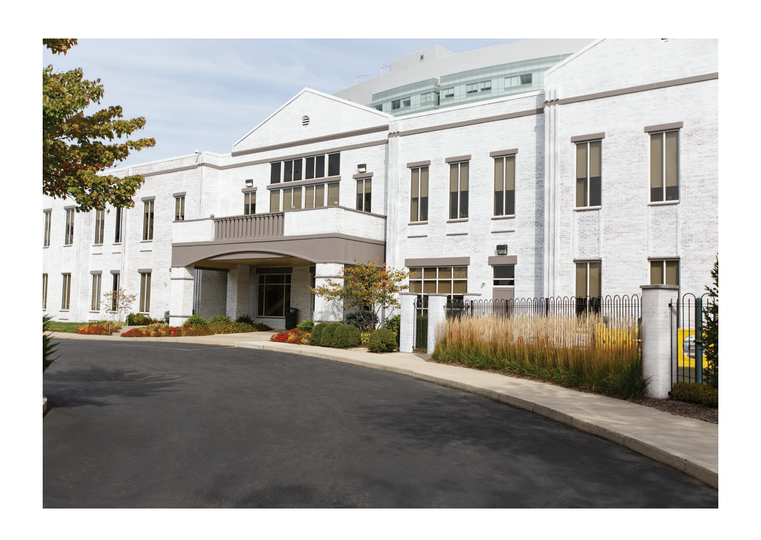
You are going to the Child Assessment Center at The Center for Family Safety and Healing.