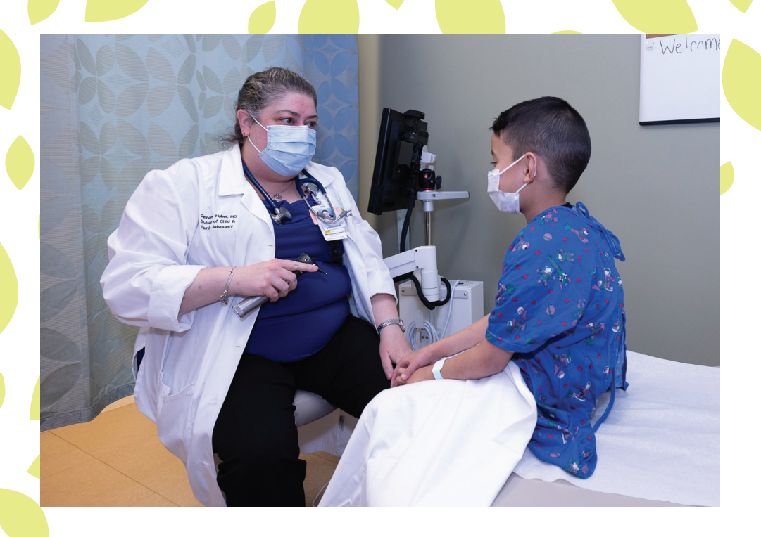
This is a safe place, and you are in charge of your body.