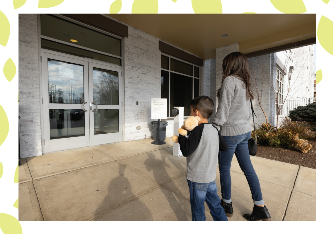
You can bring your favorite blanket or stuffed animal.