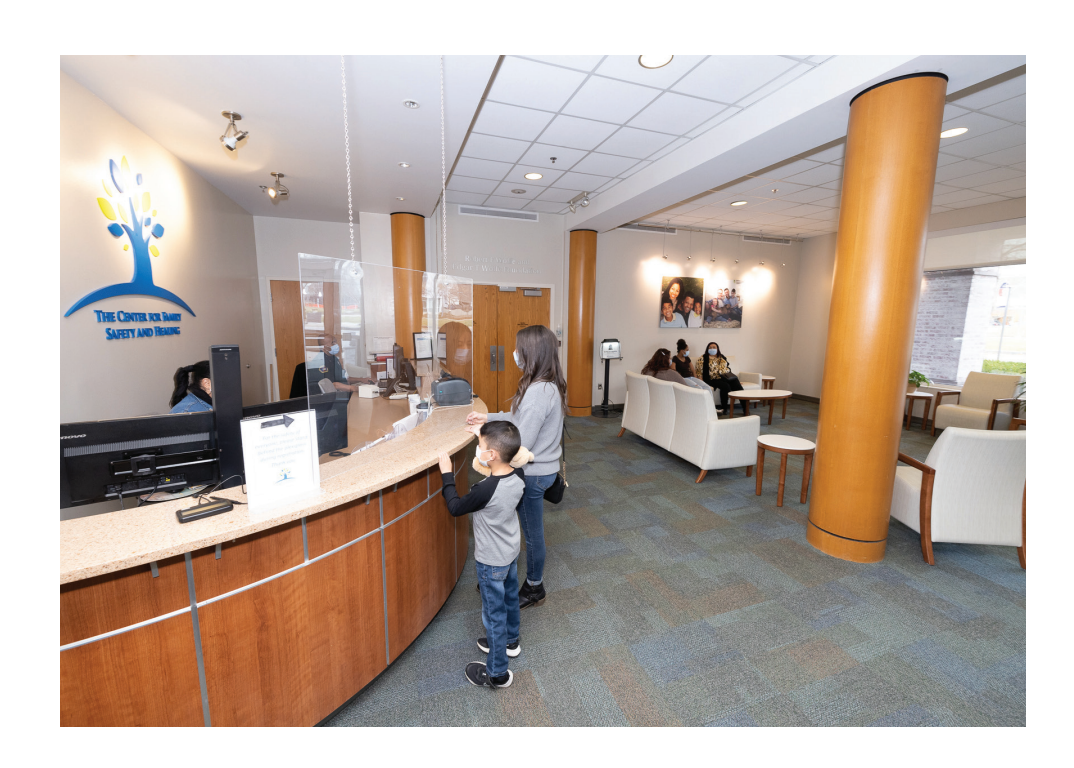
You will enter the Child Assessment Center and check-in with our team.