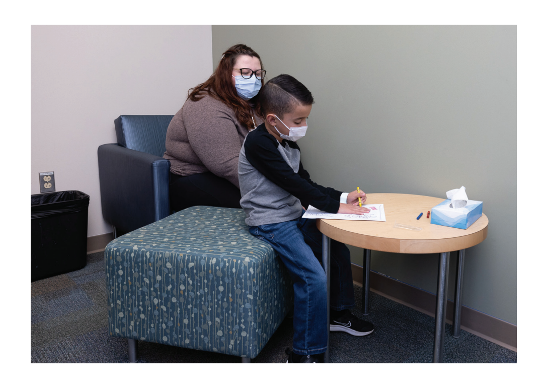
One of our team members may sit with you and keep you company while you play.