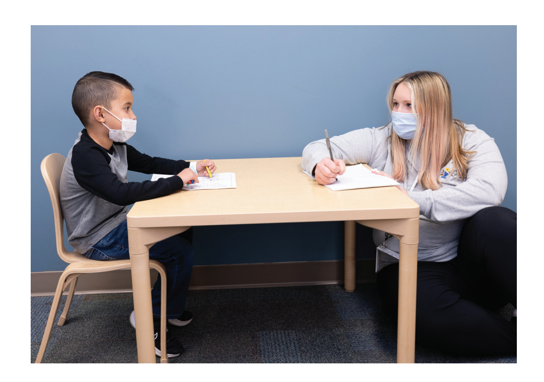
The social worker will get to know you and ask you questions.