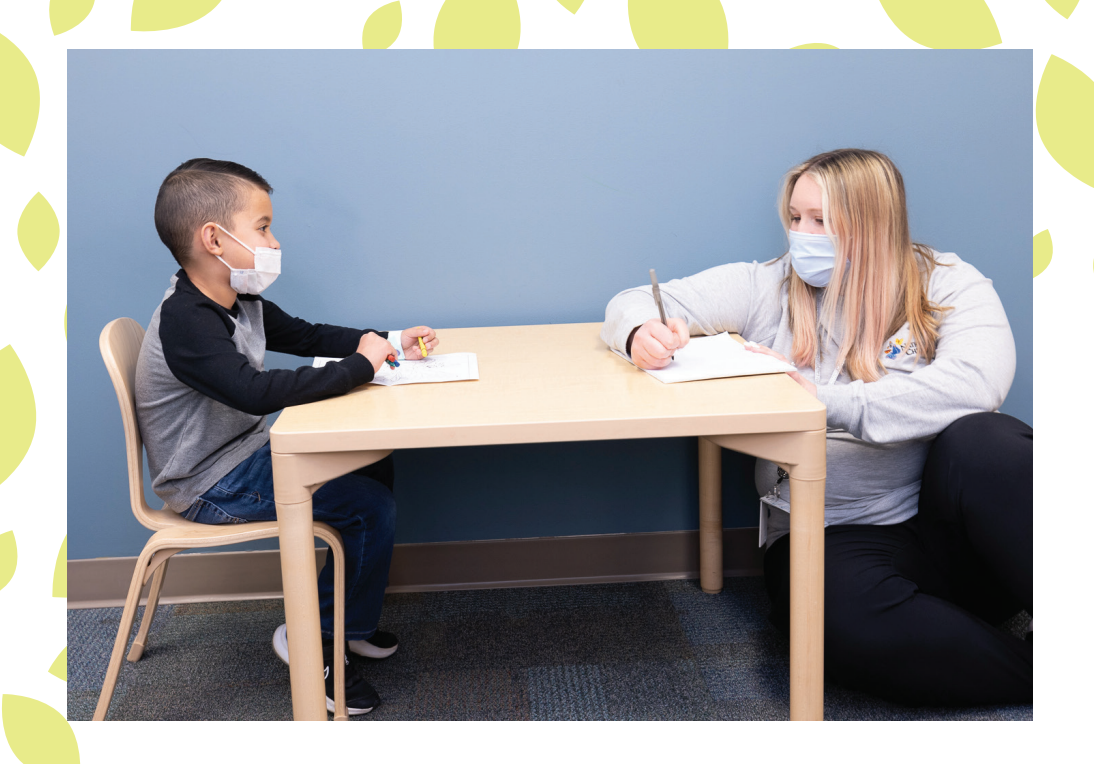
You can color while you talk. You can also ask questions.