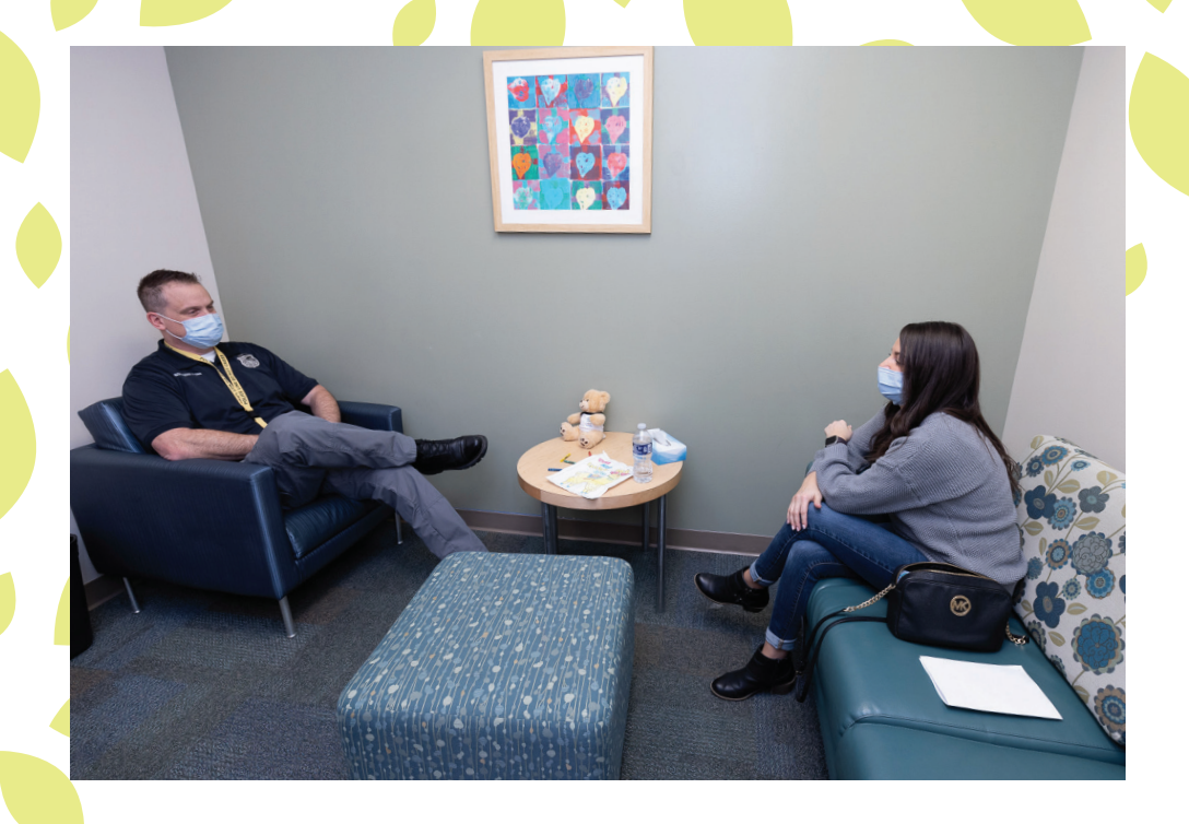
Depending on the reason for your visit, your caregiver may be asked to talk to either a police officer or someone from child protective services before you leave.