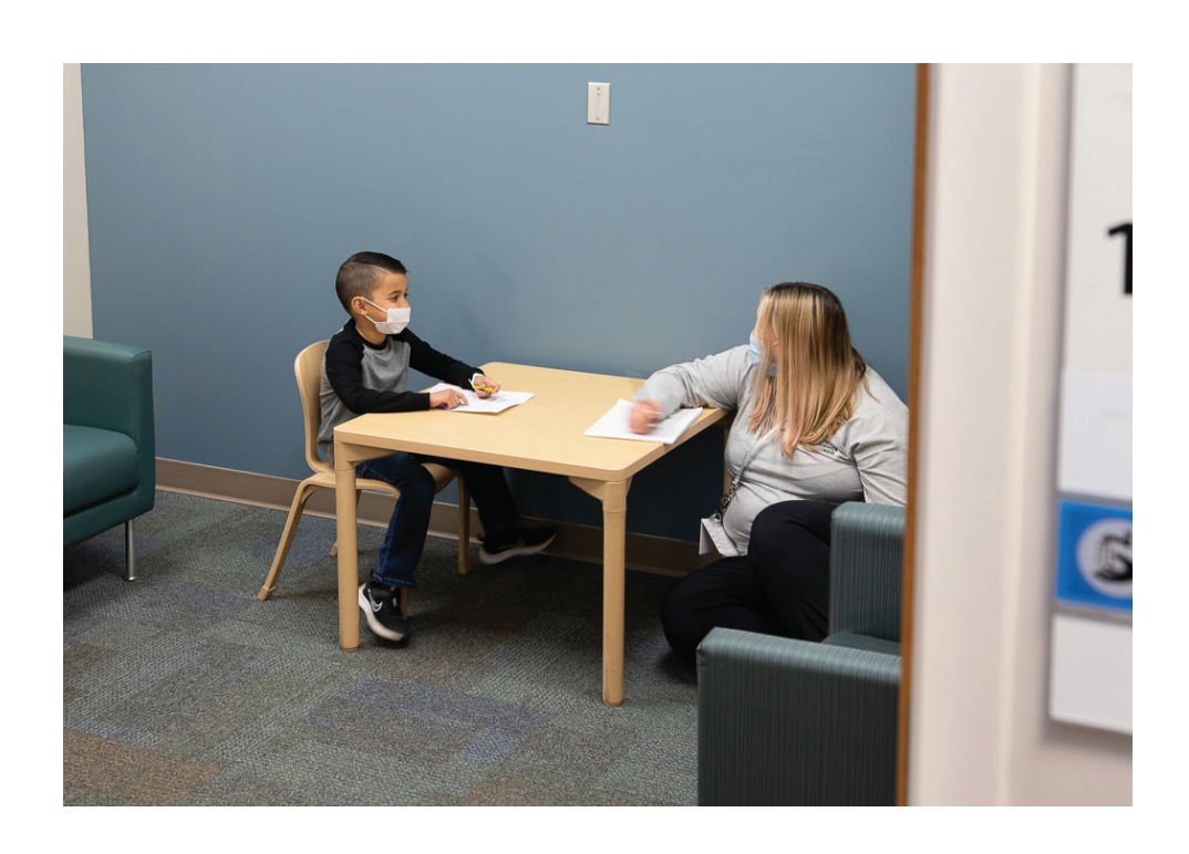
The room has comfortable places for you to sit.