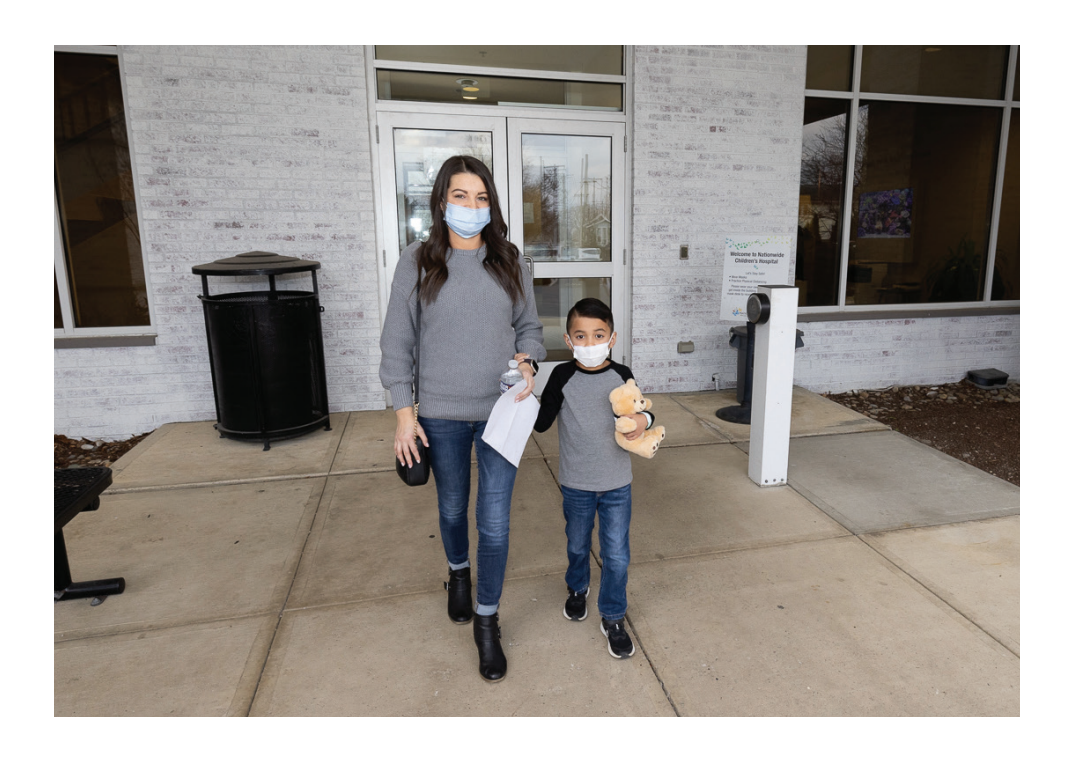
You are all done with your visit today.