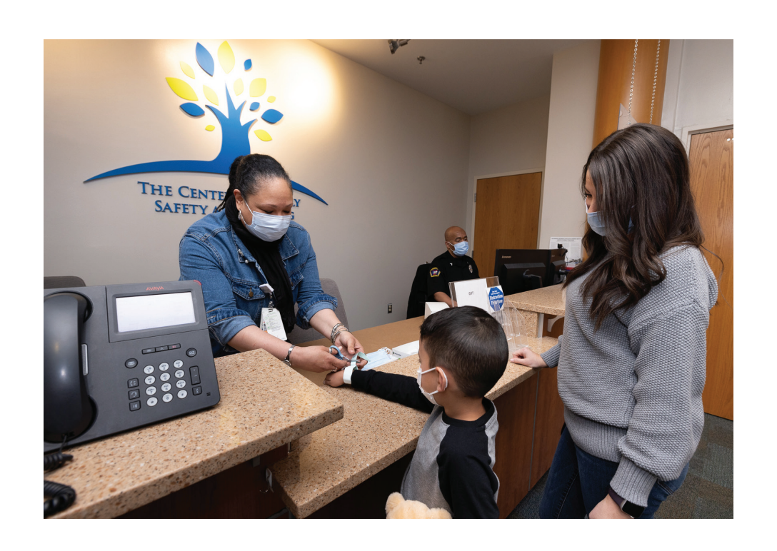
They will put a bracelet around your wrist.