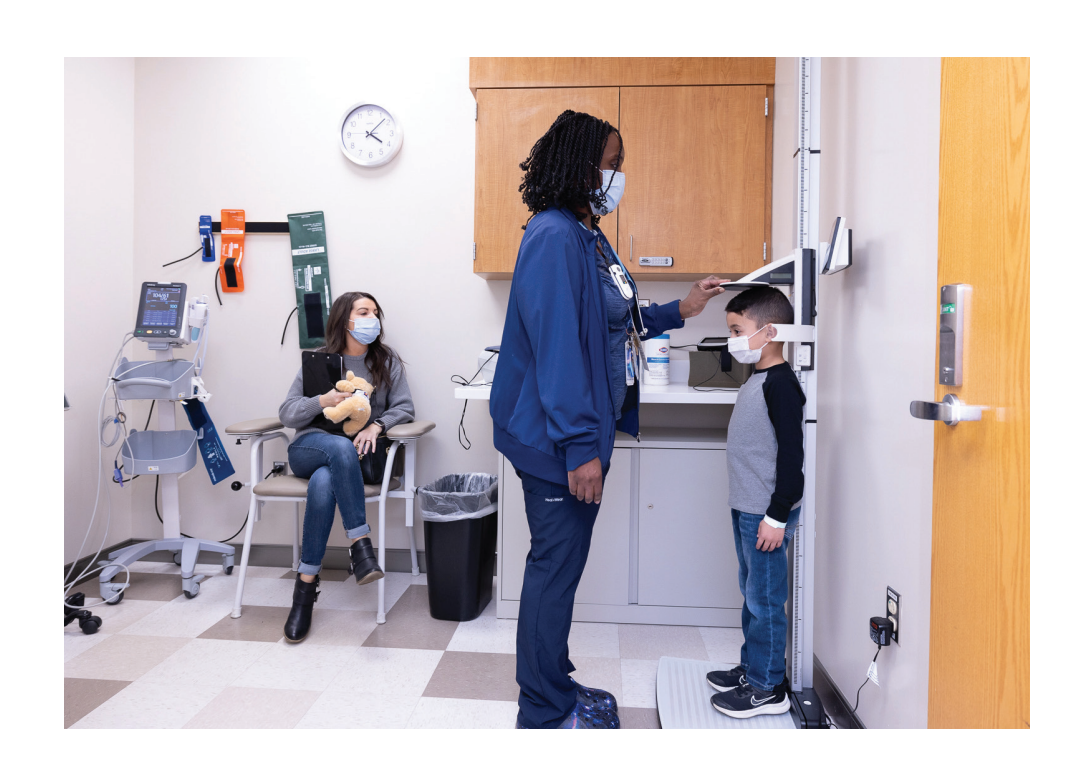
The nurse will get your height and weight.