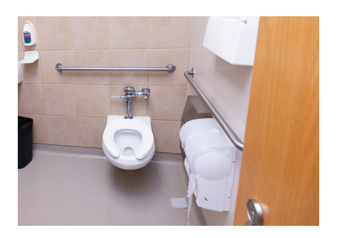
They may ask you to use the potty if you can.