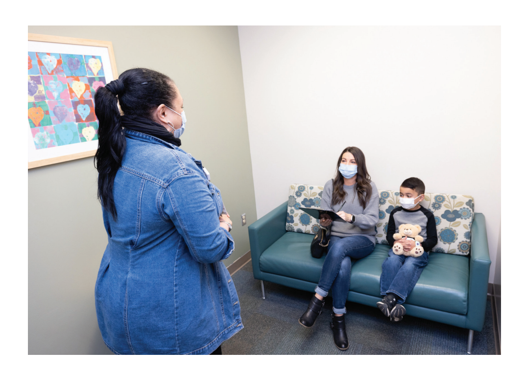
They will take you to a private room for you and your caregiver.