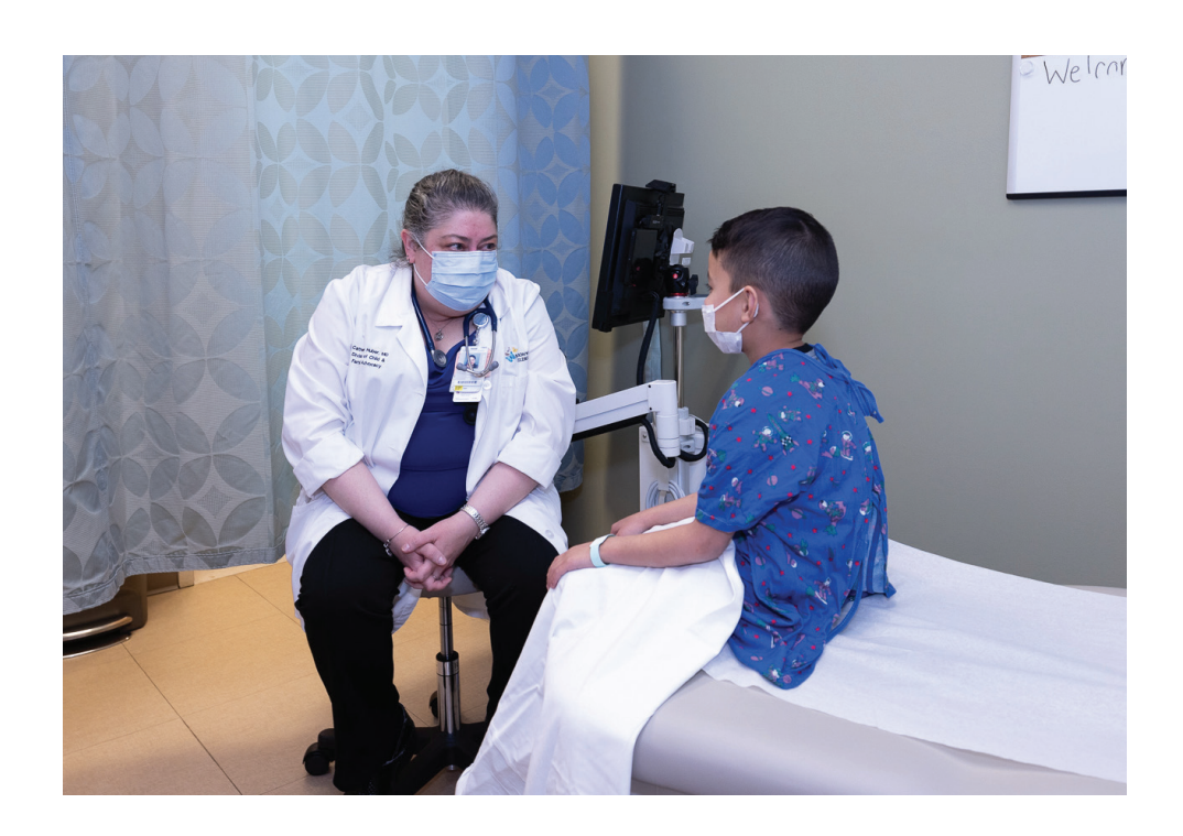
The doctor will tell you everything they are going to do before they check your body.