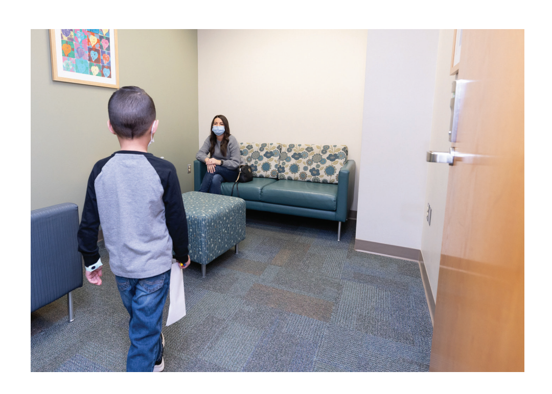
When you are done talking, the social worker will take you back to your caregiver.