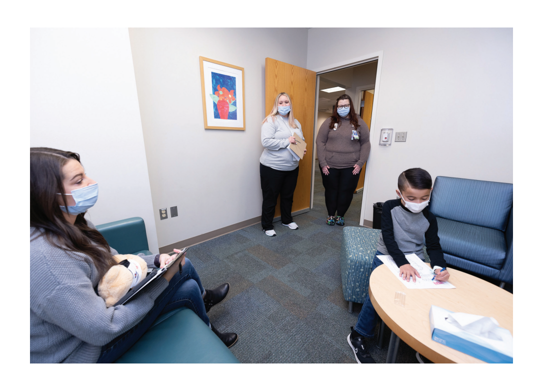
A social worker will come and take your caregiver to another room to talk.