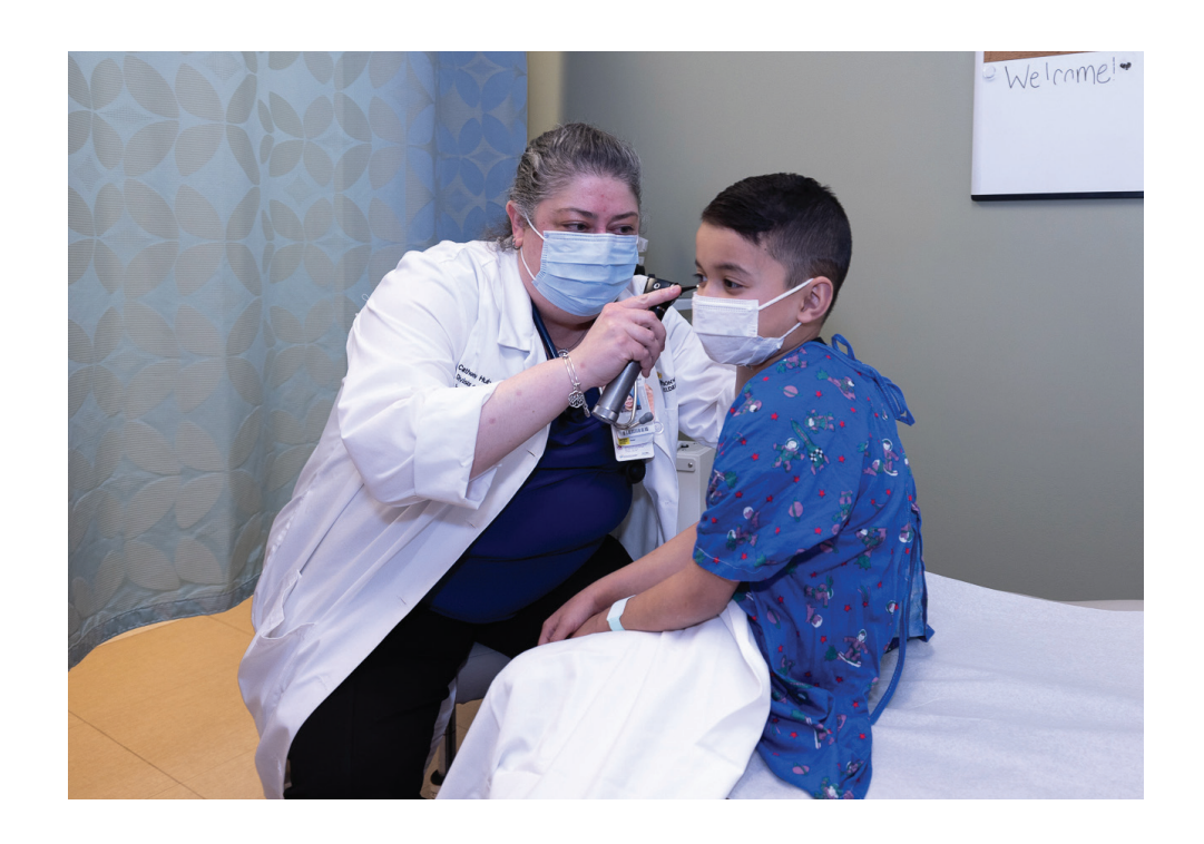
They will check your eyes, ears, mouth and your private parts.