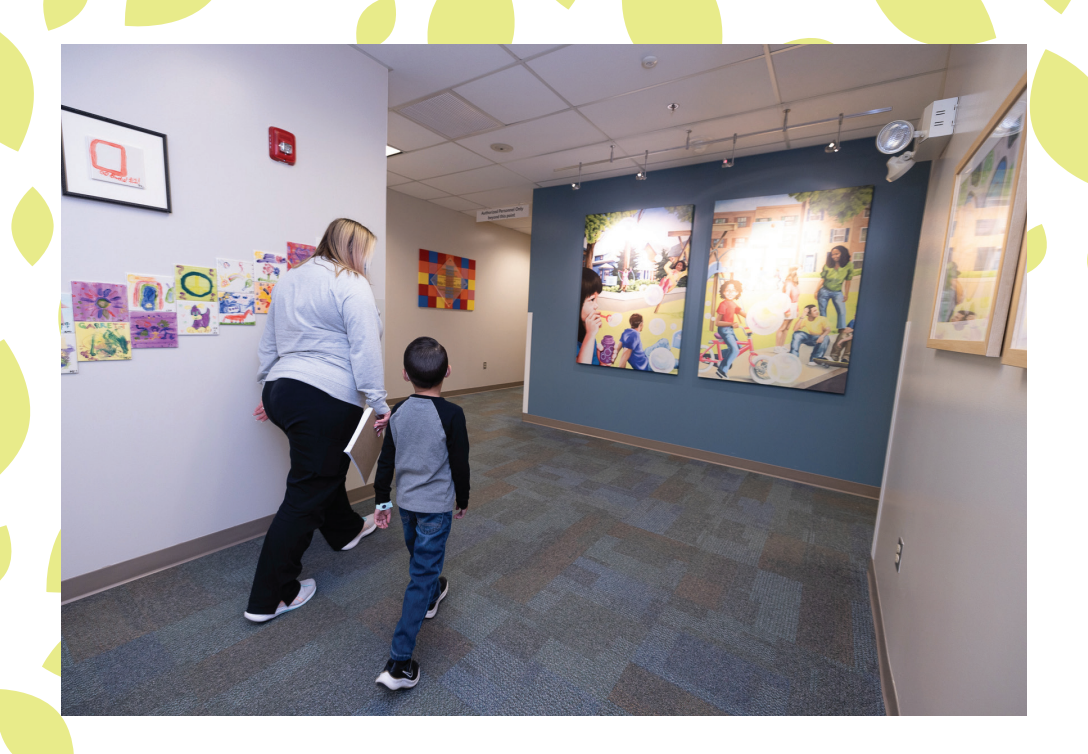
The social worker will take you to a room to talk by yourself.