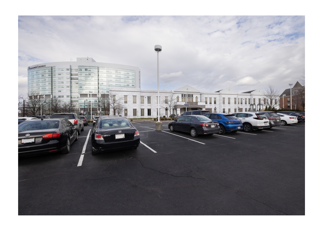
You will park in our parking lot behind our building.