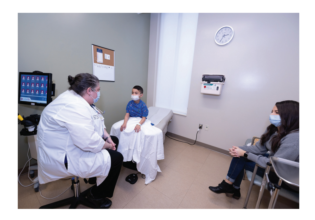
You and your caregiver will then meet with a doctor for a check-up.