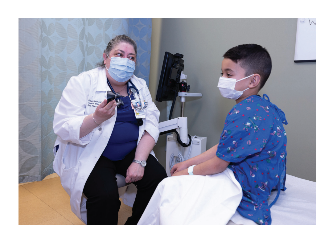
You get to decide what parts of your body the doctor can look at during your check-up.