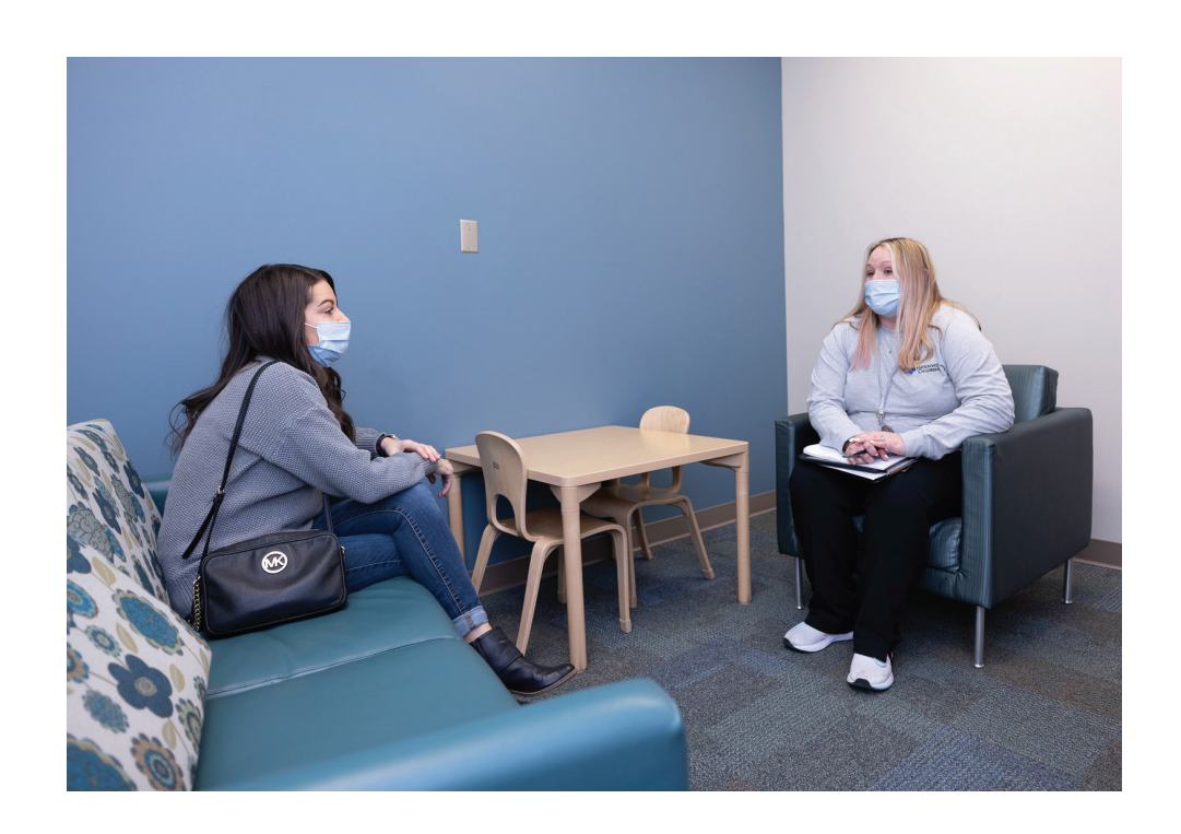
When you are all done with your check-up, your caregiver will talk to the social worker and you can play.