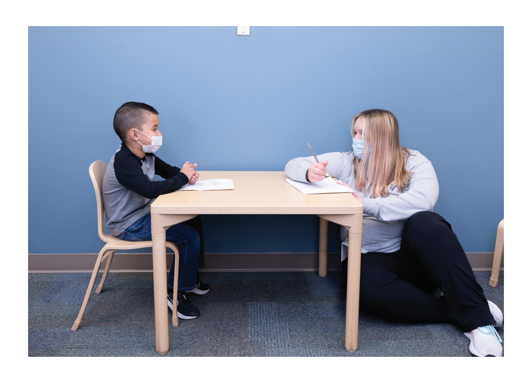
This room is a safe place, and you are in charge of what happens here.