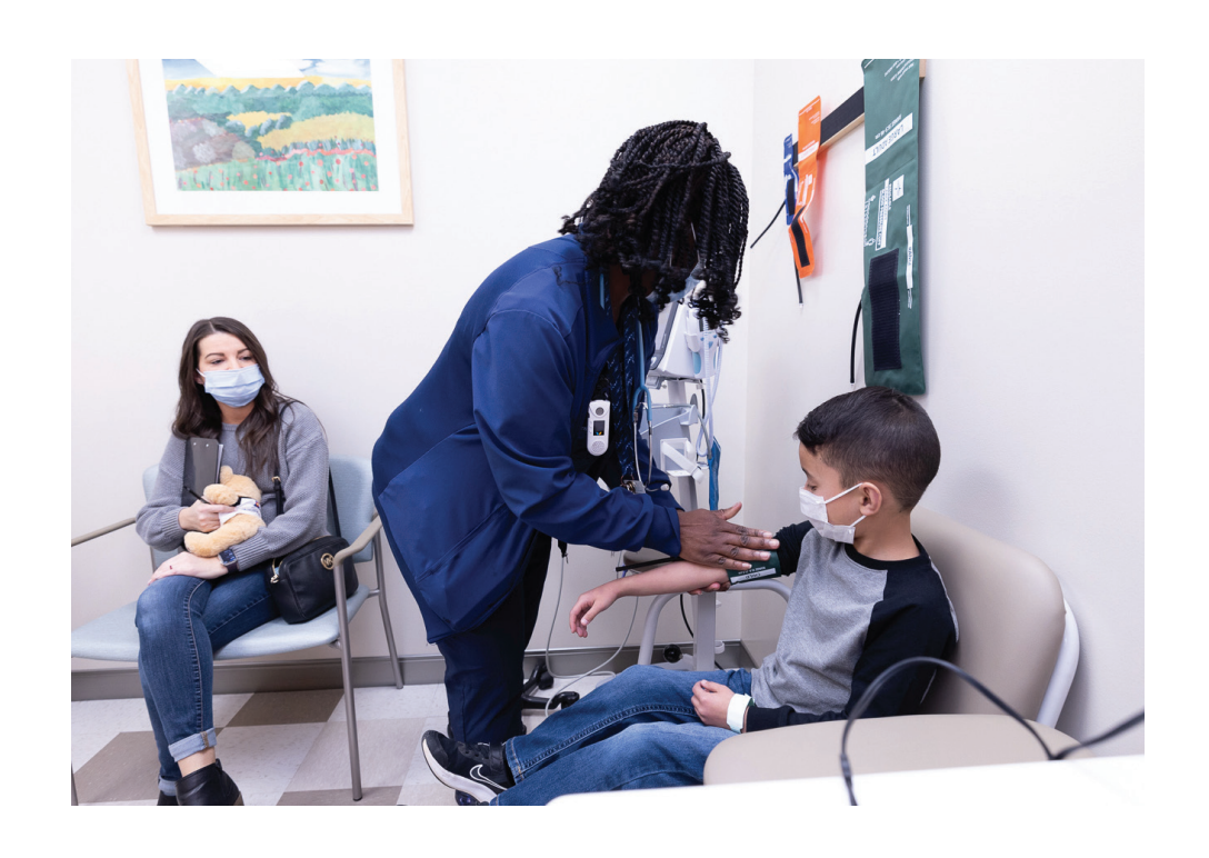
They will listen to your heart and lungs.